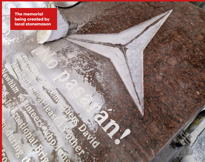
The memorial being created by local stonemason

SCAN QR CODE for International Brigade Memorial Trust searchable database