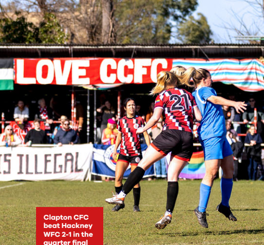
Clapton CFC beat Hackney WFC 2-1 in the quarter final