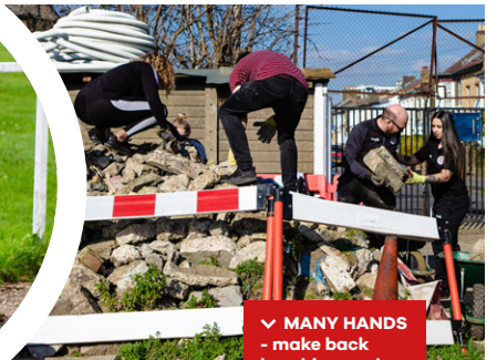
^ MANY HANDS - make back breaking work March 2021