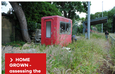
> HOME GROWN - assessing the task ahead to get the ground ready for football June 2020