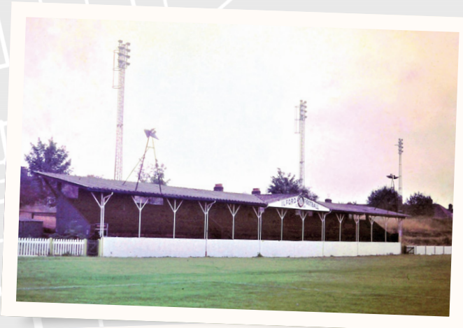
> LYNN ROAD - Ilford 17,000 saw France play India in the 1948.