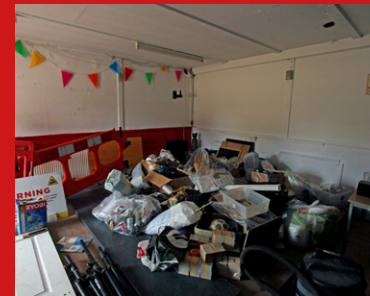
> THE CLUBHOUSE - so much hard work has been put into making a space we can all enjoy and be proud of