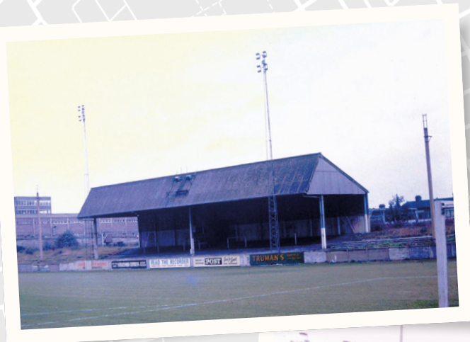
< VICARAGE FIELD - the first Isthmian League ground to host a game under lights in 1958.