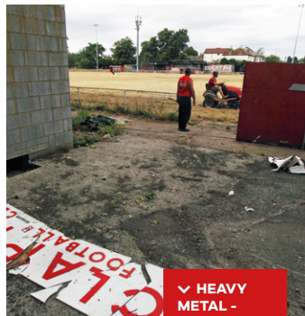
^ HEAVY METAL - Scarification September 2020