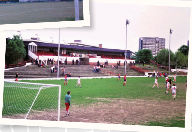
> GREEN POND ROAD - Walthamstow close to CCFC's former temporary home at Wadham Lodge