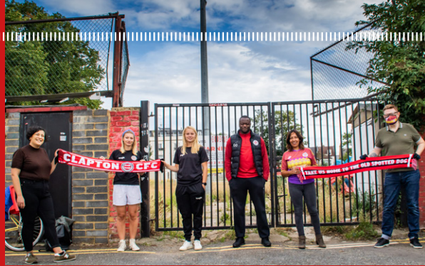
^ WE GOT THE KEYS! - celebrating with a bottle of OSD Prosecco Socialism July 2020