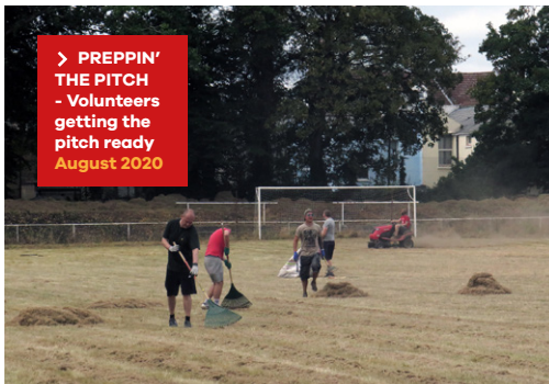
> PREPPIN' THE PITCH - Volunteers getting the pitch ready August 2020