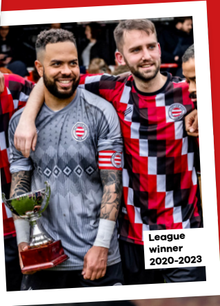
League winner 2020-2023