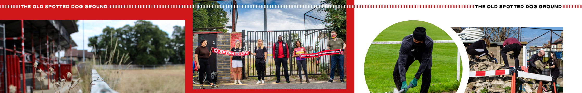
∧ WE GOT THE KEYS! celebrating with a bottle of OSD Prosecco Socialism July 2020