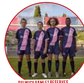
DULWICH HAMLET RESERVES