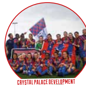
CRYSTAL PALACE DEVELOPMENT