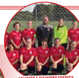
HAMPTON &amp; RICHMOND BOROUGH