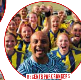
REGENTS PARK RANGERS