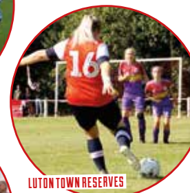
LUTON TOWN RESERVES