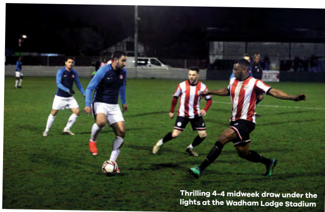
Thrilling 4-4 midweek draw under the lights at the Wadham Lodge Stadium

by we can expect NW to play attractive, attacking football that will be a real test for the Clapton backline.