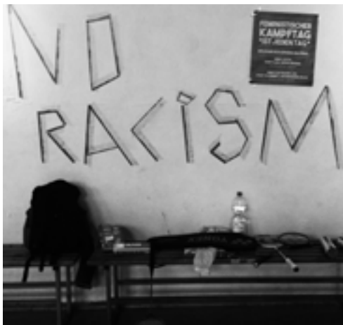
ABOVE Sports hall at Teichstrasse.

at least imitate vegan character of their business in order to prosper, which sounded like a healthy trend. Among our favourite places we visited was a kebab shop, which had been bombed by some nazis during their attack in the district, and a late night off-licence which had beer on tap and served vegan hotdogs with sauerkraut and onions! Compared to London, vegan bars in Connewitz offered tastier, cheaper and bigger portions.