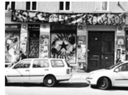
LEFT Fischladen bar in Connewitz.