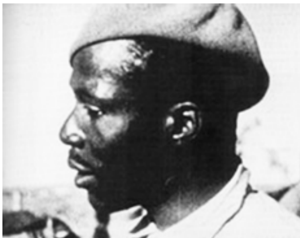
ABOVE Oliver Law

Jack Jones, a Liverpool docker, became the leader of the Transport & General Workers' Union and then the National Pensioners' Convention. He is remembered today as the instigator of the Health and Safety at Work Act.