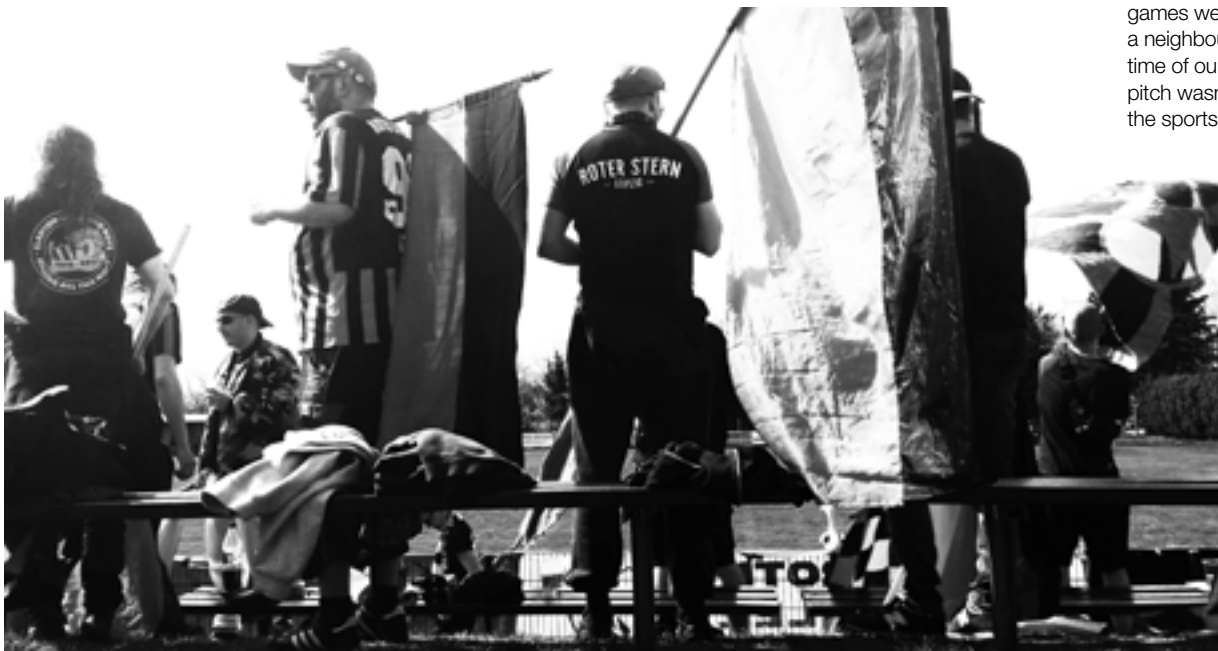
LEFT All the banners at Colditz.